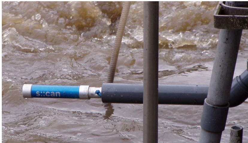
Fig. 1.5 S:CAN spectral probe