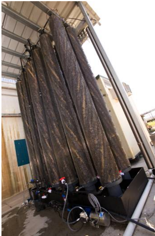
Fig. 1.4 Microbial fuel cell pilot plant