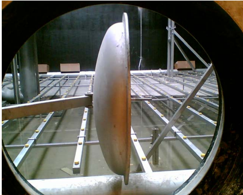
Fig. 1.3 Separate sludge liquid treatment, SBR in WWTP Zurich

The major activities within Neptune during first project year were establishing analytical methods and devices as well as installation and operation of pilot-scale and full-scale plants.